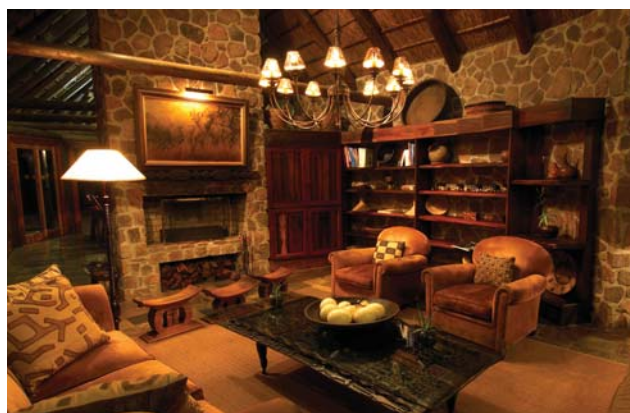
The Kudu Lodge was designed for relaxation. Guests are pampered with gourmet food, wine, and first class service.